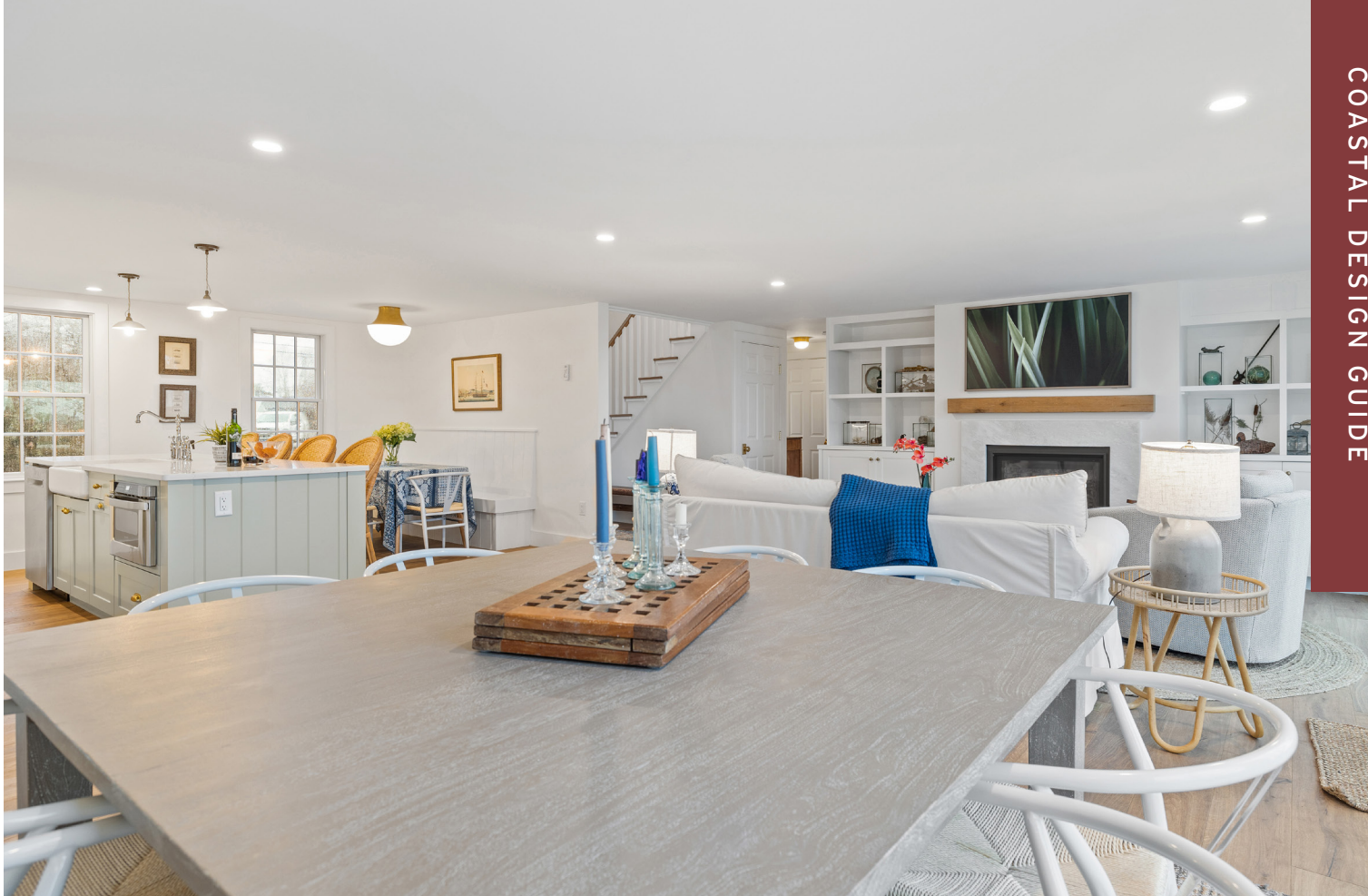
This open-plan Cape House is perfect for informal gatherings, offering ample seating and dining space for a crowd. Its calming coastal color palette reflects the nearby beach, while wicker, white cotton, and reclaimed wood elements create a relaxing atmosphere.

stronger and tides are higher. King Tides are happening in tandem with storm surges, which used to be a rare occurrence but today is commonplace.