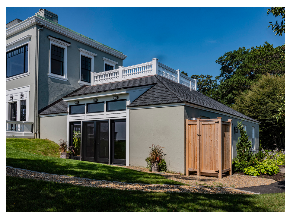
At our West Beach project, we added a "beach house" equipped with an outdoor shower and an indoor full bath for rinsing off sand and salt before entering the formal main house. This space also features a kitchenette for beach snacks and drinks, as well as a comfortable lounge area.

Coastal-grade windows and doors are essential, and it is crucial that siding and trim details are water- and wind-tight and installed by trained professionals. Red Barn's continued involvement throughout