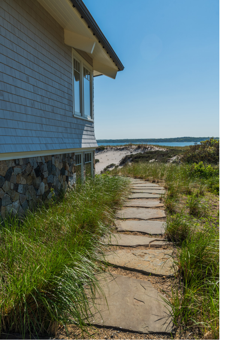
Careful consideration of construction and landscaping in dunes and flood zones is crucial to protect sensitive ecosystems, comply with regulations, manage flood risks, ensure structural stability, and promote sustainability.

plays a critical role in storm damage prevention, flood control, and providing wildlife habitat. The Massachusetts Department of Environmental Protection enforces specific regulations for building in these sensitive areas.