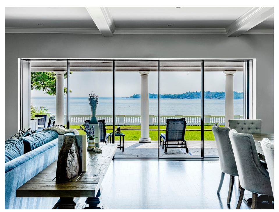
Coastal-grade windows create a panorama overlooking Beverly's West Beach in this historically-sensitive renovation project.

We start by considering your goals, lifestyle, and personal values. This includes whether the home will be a vacation home, a primary residence, or even a rental property. Is the home for a family with children or a couple looking to retire? All of these factors dramatically affect the layout of the home.