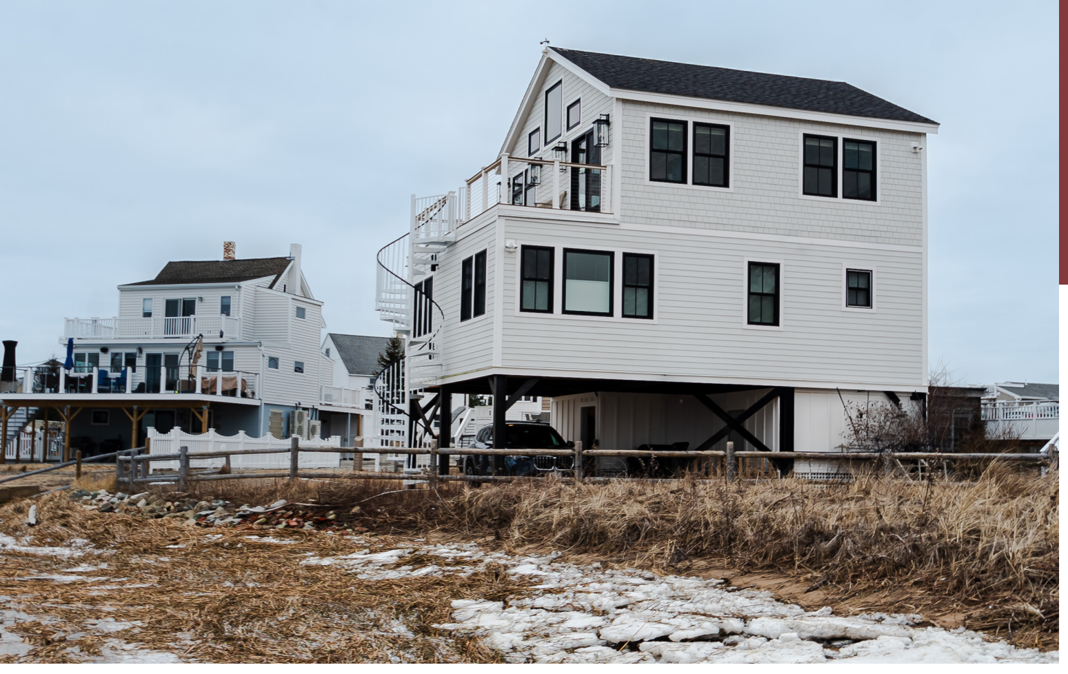
This home on Plum Island is crafted to meet environmental standards, including the Massachusetts Wetlands Protection Act. Elevated on piers two feet above FEMA flood levels, it is designed to withstand storms and support dune dynamics and native vegetation growth. The surrounding pea stone and sand surfaces enhance groundwater health and stormwater management.

Red Barn has worked with qualified coastal builders and can make recommendations. Every great project starts with a great team, and we're here to help you select and manage that team from beginning to end.