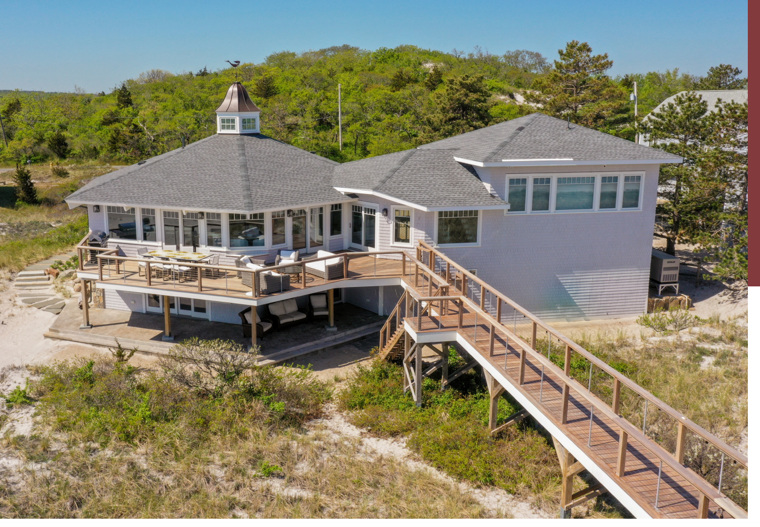
Nestled within the dunes, this Wingaersheek Beach project involved meticulous site planning and coordination with the Conservation Commission. The house is strategically placed in a dip in the dunes, making it almost invisible from the beach.

management attention is needed to protect important historical, cultural, and scenic values, or fish and wildlife or other natural resources.