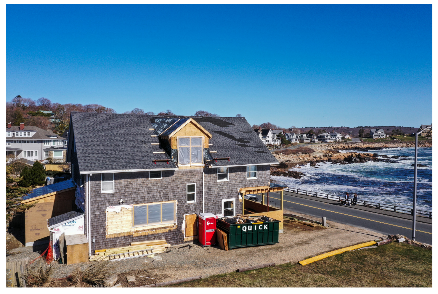
This substantial addition/renovation on Gloucester's Back Shore has demanded extensive site coordination by our construction partners. Facing the open water with limited parking and staging areas, the project benefits from our builder's expertise in managing tight sites in this neighborhood.

Assembling the team of specialists for your project can seem overwhelming, but we look forward to earning your trust through this initial effort. Red Barn knows the engineers, wetland scientists, and lawyers with the appropriate waterfront experience across Cape Ann.