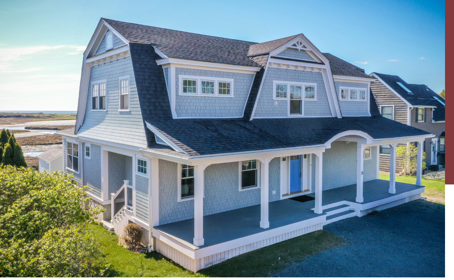
This new construction project, overlooking Good Harbor Beach is a classic Shingle Style home featuring a gabled roof with a substantial roof rake. The exterior facade is enhanced by a trim break with ornamental corbels and a flared skirt, adding elegant detail.

the construction process is vital to ensure that contractors and their subcontractors adhere strictly to the specified requirements. In challenging conditions, architectural representatives are also available to provide consultation and advice to the design and construction team.