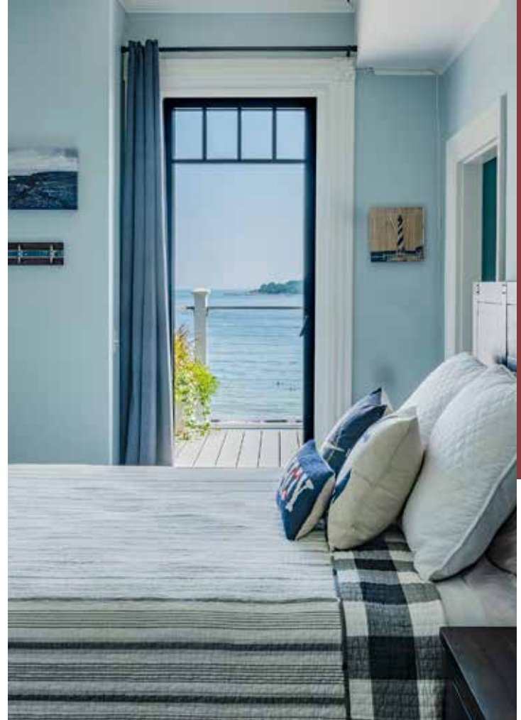
A private balcony, featuring low-profile railings, invites the fresh salt air into this child's bedroom overlooking West Beach.

Coastal living isn't just about views; it's also about activities and making sure you have proper storage for all the gear that comes along with those pastimes. As we begin to work together, we will identify your household's core values and also explore how you will use the home throughout a normal day. We'll find out if you'll be spending time perfecting your golf game or if you prefer relaxing and restorative days at the beach. Do you need a space to store your boat through the winter months? What about an ice maker and