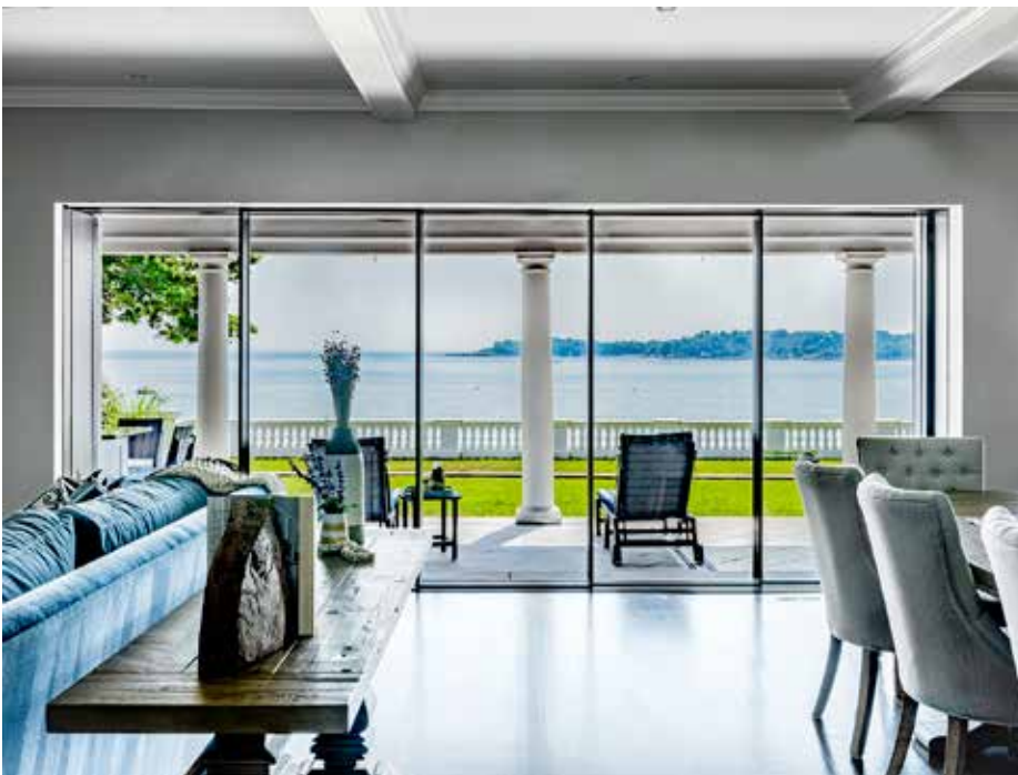
Coastal-grade windows create a panorama overlooking Beverly's West Beach in this historically-sensitive renovation project.

We start by considering your goals, lifestyle, and personal values. This includes whether the home will be a vacation home, a primary residence, or even a rental property. Is the home for a family with children or a couple looking to retire? All of these factors dramatically affect the layout of the home.